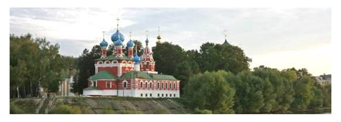
June 21, 2018. MOSCOW City tour / Novodevichi Cemetery / Metro Ride