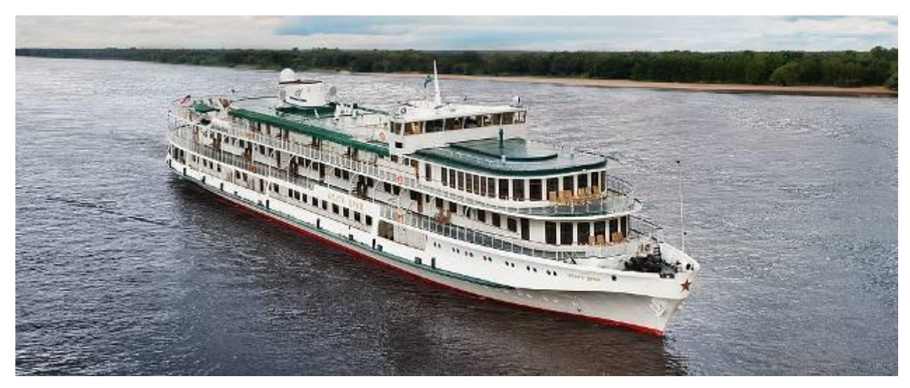
1) Sample Program - times and order of tours may be subject to change. Please request exact travel schedule for each individual cruise

12 nights aboard the luxurious MS Volga Dream